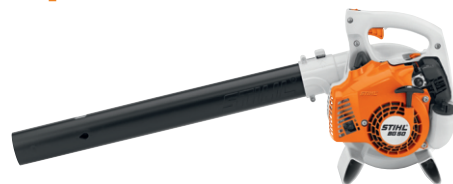
Stihl BG 50 Leaf Blower.