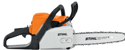
Stihl MS 170 chainsaw.