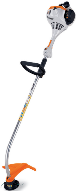
Stihl FS 38 Trimmer.